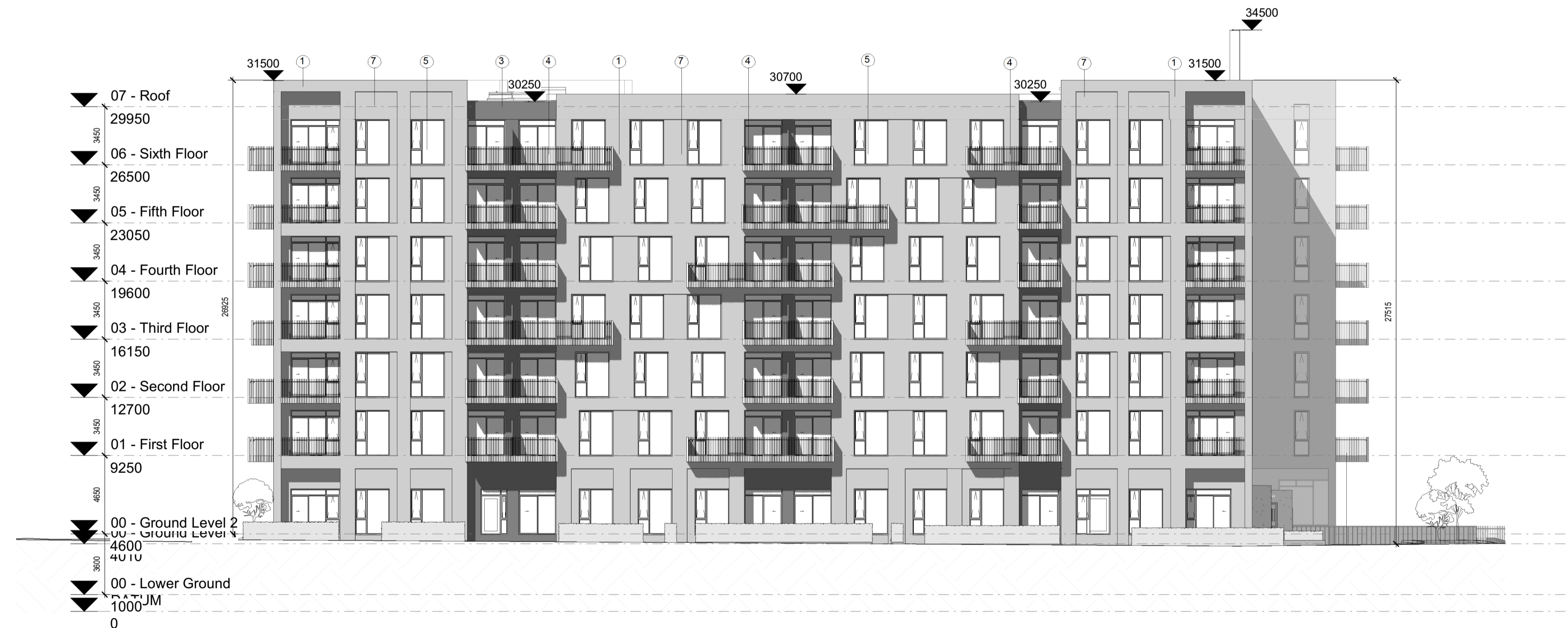
2 Block 1 - West Elevation 1 : 200