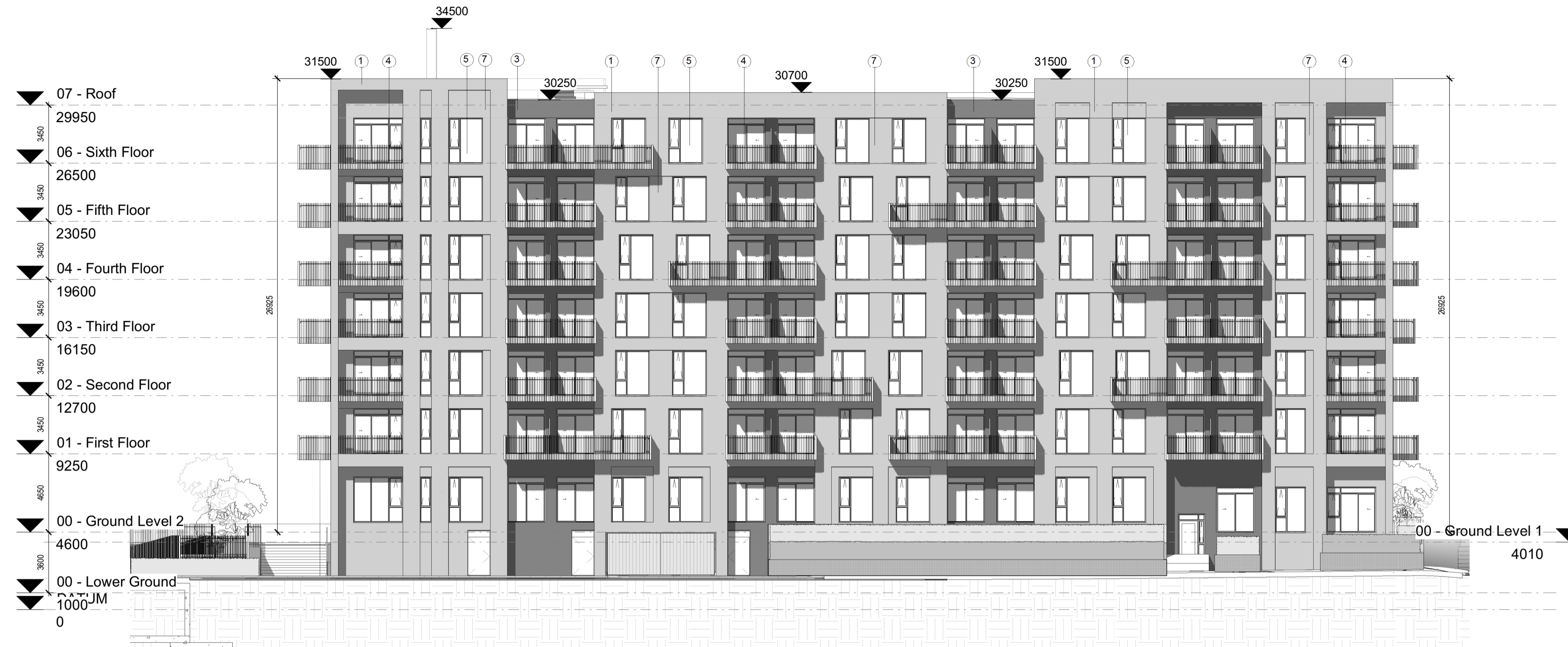
1 Block 1 - East Elevation 1 : 200

NOTE ALL DIMENSIONS TO BE CHECKED ON SITE NO DIMENSIONS TO BE SCALED FROM THIS DRAWING THIS DRAWING IS TO BE READ IN CONJUNCTION WITH RELEVANT CONSULTANTS DRAWINGS